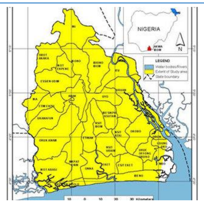
Fig 1: The Study Area

Akwa Ibom State is home to diversities of biological and geological resources including crude oil which have given rise to livelihood such as farming, fishing, sand mining, hunting, lumbering, fire wood gathering and oil mining with attendant effect on the social-economic and physical land scape of the area. In spite of these resources Akwa Ibom State remains one of the states with the highest indices of multi-dimensional poverty in Nigeria (National Bureau of Statistics, 2022). There is limited access to basic services including safe drinking water, sanitation, health care, electric power and decent housing. The housing condition especially for the rural dwellers is despicable (plate I) and fell short of standards for human habitation (Udoh, 2016). In the urban areas, the housing conditions are characterised by overcrowding, absence of sanitation facilities (plate 2) - where shared latrine and open defecation are widely practiced. Household water is unsafe - drawn from untreated boreholes. Home owners are few while tenancy is wide-spread with exorbitant rent and insecure tenure (Udoh, 2020). The effect of insecure and stressful tenancy in the urban area and large-scale sub-standard housing in the rural areas is manifested in homelessness for some citizens of the State especially the orphan, widow, poor, elderly, sick, disable and other vulnerable people.