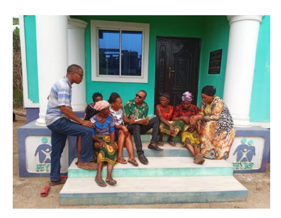
Plate 8: Some of the beneficiaries of the supportive housing narrating their experience