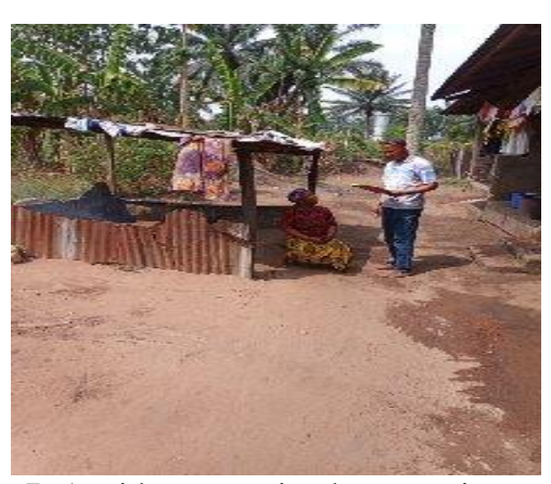
Plate 7: A widow narrating her experience with poor housing condition