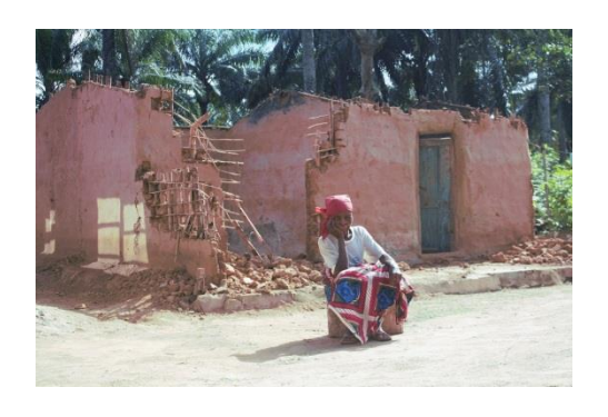
Plate 5: Before FEYRep intervention