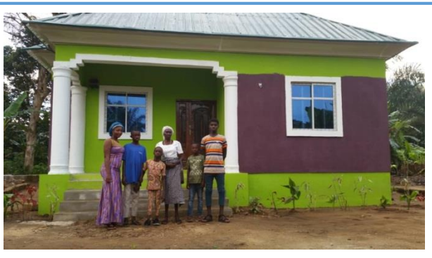
Plate 4: After FEYRep intervention