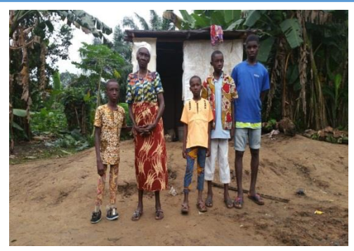
Plate 3: Before FEYRep intervention