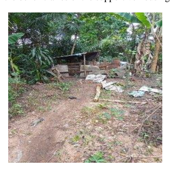
Plate 9: Poor Latrine situation in the study area