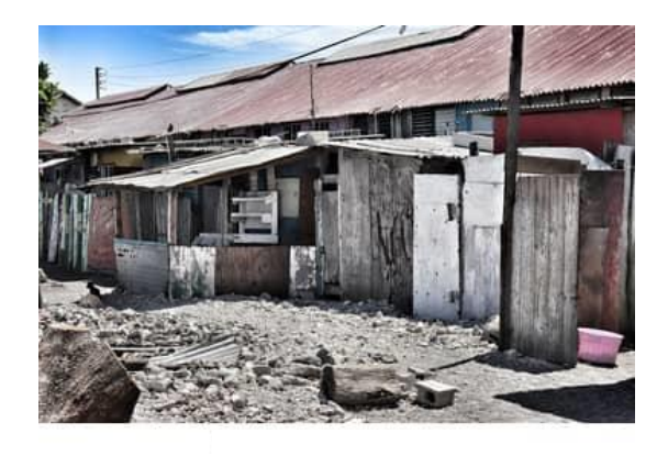
Plate 2: Typical Urban Housing setting in the Study Area