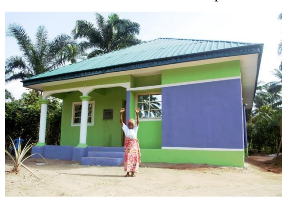
Plate 6: After FEYRep intervention