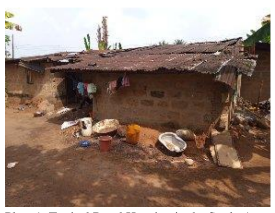
Plate 1: Typical Rural Housing in the Study Area