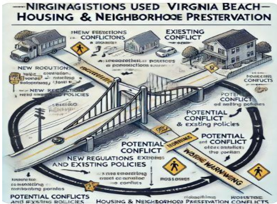
Figure 3: Crosswalk Process Used by Virginia Beach Housing (Virginia Beach Housing & Neighborhood Preservation, 2024).

use of systematic tools, centralized resources, and rigorous auditing practices. These methods not only facilitated adherence to federal guidelines but also enhanced the department’s ability to deliver effective and transparent housing programs during a challenging period. The department’s commitment to innovative compliance strategies provides a valuable model for other agencies seeking to navigate the complexities of federal program implementation (Taylor, 2020).