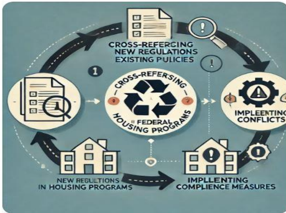
Figure 2: Compliance Process in Federal Housing Programs (Virginia Beach Housing & Neighborhood Preservation, 2024).

regulations but in maintaining the operational capacity to consistently meet compliance standards over time. Without the necessary resources, expertise, and infrastructure, housing authorities risk program failure, legal repercussions, and a loss of public trust (Williams et al., 2021).