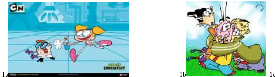
Illustration: 1) Dexter's Laboratory 1b) Ed, Edd and Eddy