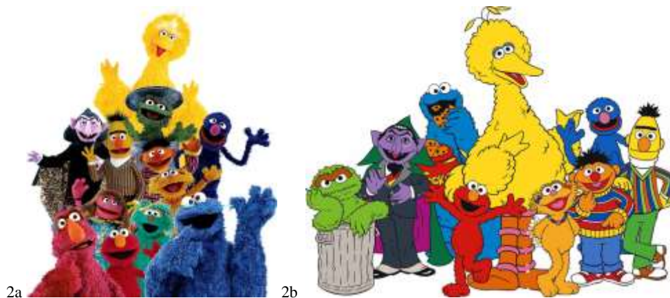
Illustration: 2a and 2b: Sesame Street

It is true that animated cartoons also have a positive social impact on children. It serves as an important educational and socialization tool. They have helped children expand understanding of the world they live in; it has provided them opportunities to learn the values of the nation they live in and the culture, civilization of other children and countries. Parents have used animated cartoons to babysit. They have also been used to provide entertainment and relaxation for children. The educational puppet cartoon series, Sesame Street (illustration 2), launched its campaign- Healthy Habits for Life , to encourage young children to adopt a more dynamic and nutritious lifestyle featuring the benefits of fruits and veggies in their daily diet. An animated cartoon series created to encourage British children to eat more fruit and vegetables has become the focus of a new Department of Health campaign. Trials have shown that the cartoon prompted a dramatic increase in children's consumption of fruit and vegetables.