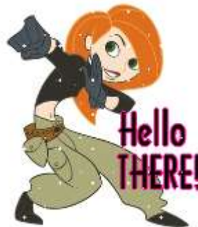
Illustration 3: Kim Possible, the Girls’ Role Model

American Dragon is about “Jake Long”, a young boy who frequently turns into a dragon in order to fight crimes and injustices. The fact that boys prefer “Ben 10” and “American Dragon” (illustration 2) is not surprising as the cartoons have ordinary boys as their protagonists who perform heroic deeds with the use of superpowers. The feeling is mutual about “Scooby Doo” among the boys and girls maybe because it has both male and female characters taking up serious roles in fighting crime and resolving mysteries. Each of the characters in this cartoon, be they male or female take up key roles in whatever it is that needs to be resolved. This could mean that children prefer cartoons that enhance their gender and portray them in a good light and as responsible people in society.