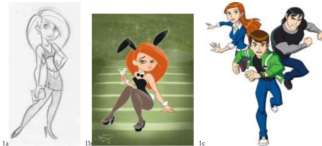
Illustration: 1a and 1b) Kim Possible 1c) Ben 10

Although boys did not describe boy-characters in relationship to girls, the boys did tend to describe girl-characters in the context of their relationships to or interest in boys. This included such statements as, “(girls) ask boys out on dates,” they “follow what boys say,” they are “left out of play,” they are “not as adventurous,” they are “teased by boys,” and they “want kisses.” Boys also described girl-characters domestic role behavior or referred to the girl’s appearance (Meyer, 2016). Examples of this included they “say ‘I’m pretty’” and they “wear rings.” Girls described girl-characters as domestic, playing with dolls, dressing up, and chasing boys. Specific examples included doing “chores around the house”, “being polite” and saying “excuse me” a lot. Clearly, the majority of children in this study perceived male and female cartoon characters in stereotypical ways. In a study funded by the National Heart, Lung and Blood Institute, (Williams, 2014) a survey of girls 9 and 10 years old, found that 40% had tried to lose weight. Fifth graders, 10-year-old girls and boys told researchers they were dissatisfied with their bodies after watching animated cartoons like Ben 10 and Kim Possible (illustration 1), and music video by Britney Spears (Mayer, 2015). Identification with cartoon stars, models or athletes for girls and boys positively correlated with body dissatisfaction. This has an effect on the body image of the children who watch them.