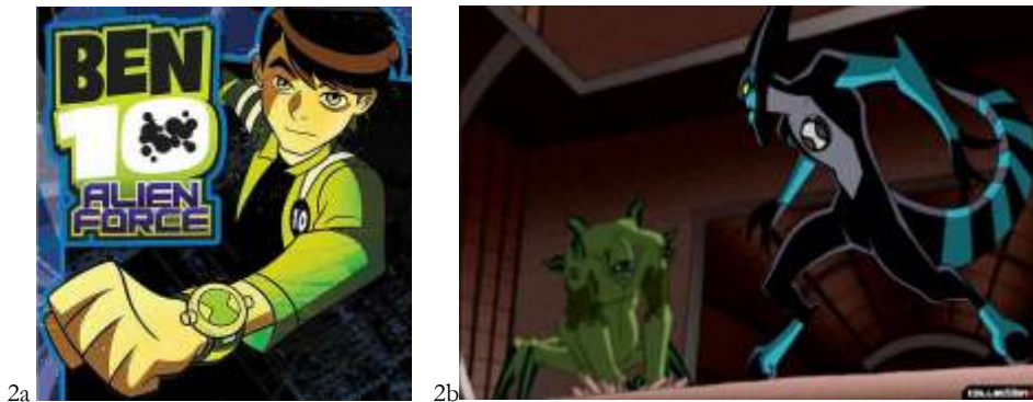
Illustration 2a: Ben 10 and 2b: American Dragon

American Dragon is about “Jake Long”, a young boy who frequently turns into a dragon in order to fight crimes and injustices. The fact that boys prefer “Ben 10” and “American Dragon” (illustration 2) is not surprising as the cartoons have ordinary boys as their protagonists who perform heroic deeds with the use of superpowers. The feeling is mutual about “Scooby Doo” among the boys and girls maybe because it has both male and female characters taking up serious roles in fighting crime and resolving mysteries. Each of the characters in this cartoon, be they male or female take up key roles in whatever it is that needs to be resolved. This could mean that children prefer cartoons that enhance their gender and portray them in a good light and as responsible people in society.