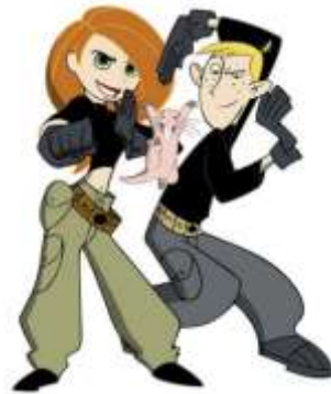
Illustration 4: Kim Possible

During the focus group discussions some of the boys admitted that they do not like the “tumbo cut” and “short skirts and shorts” worn by Kim Possible. They feel it is indecent. Some of the girls say that the dressing is indecent and you can only dress like that at home. While some feel it is fashionable. They felt the cartoons are educative like Kim Possible going to different countries. Asked if they would like cartoons based on Bible stories or African folk tales, the girls admitted that they would like to see animated cartoons based on the Bible and African folk tales. Bible cartoons came only on Saturday mornings on Family TV and some of them are usually at church.