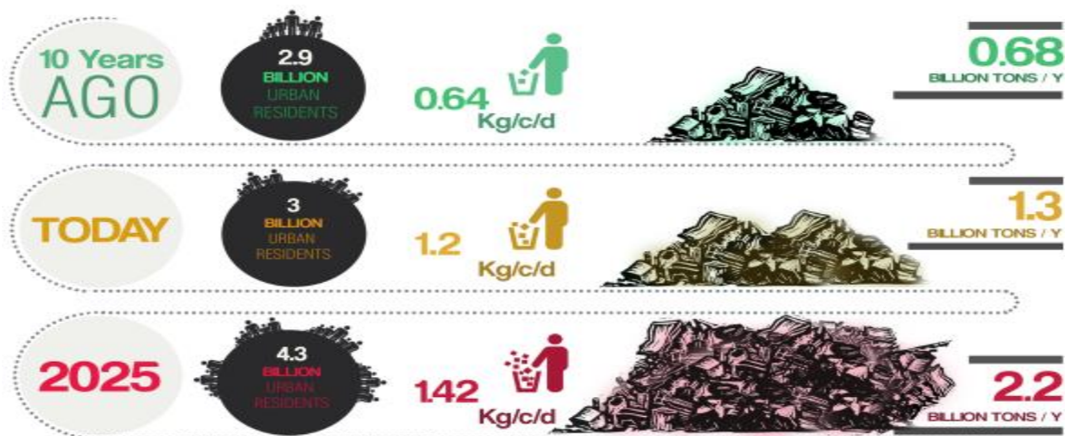
Figure 1: Municipal Solid Waste Quantities (Hoornweg and Bhada-Tata, 2012)