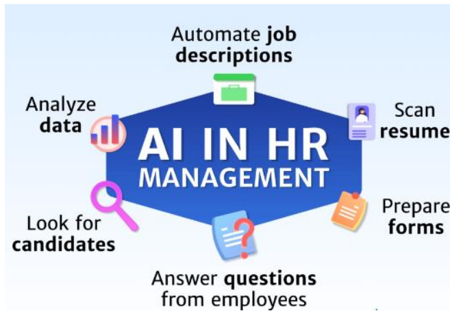
Figure 1: Components of AI in HR landscape

With AI tools and software, HR professionals can reduce bias and, therefore, have better decision-making. Their informed decisions are made based on analyzing a massive amount of data, not human judgment or guesswork. This helps businesses ensure equality and inclusion for all staff in the workplace.